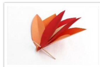
Step 3 – Insert toothpick