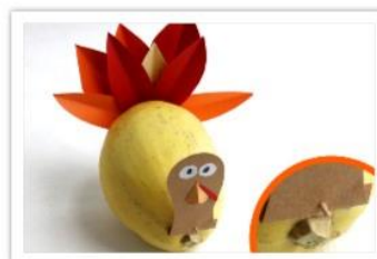
Step 7 – Detail of how to attach turkey head