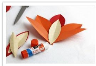
Step 2 – Glue feathers