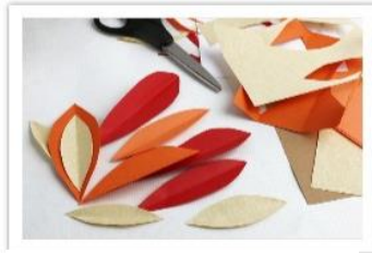
Step 1 – Cut feathers

Thanksgiving Craft Ideas: Vegetable Turkeys