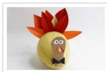
Step 8 – Make bowtie to cover toothpick. Voila!