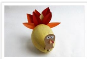
Step 7 – Attach folded end of turkey head