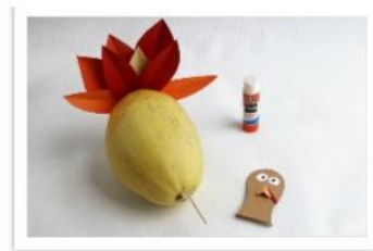
Step 6 – Insert toothpick