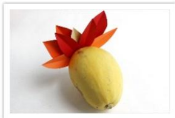
Step 4 – Attach feathers