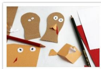
Step 5 – Make face