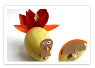
Step 7 – Detail of how to attach turkey head