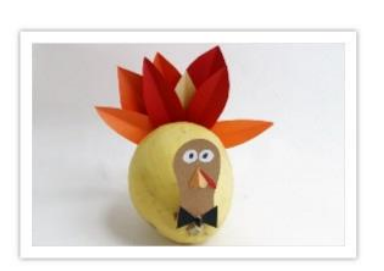
Step 8 – Make bowtie to cover toothpick. Voila!